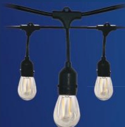
S8020 – 24-FT / 12 Light LED string set

A new classic 24-ft LED decorative string light, which can transform any space into a stylish evening experience. Each strand includes 12 energy efficient, vintage style Edison LED light bulbs which deliver a perfect warm glow. Featuring a heavy duty, weatherproof cord with slots for easy installation, yet flexible so they can be used to illuminate various spaces such as patios, decks, pool areas and gazebos to name just a few.