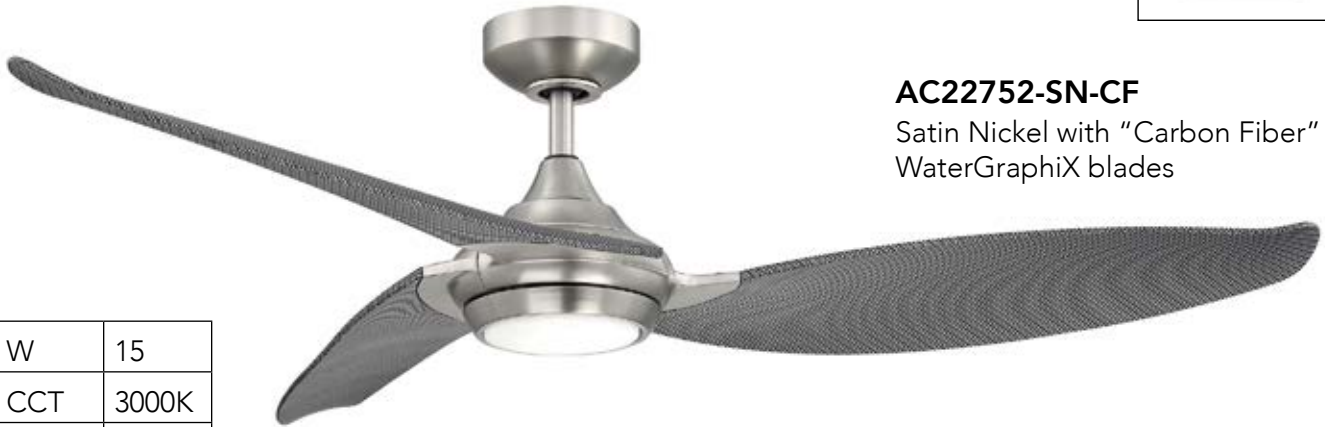
AC22752-SN-CF Satin Nickel with "Carbon Fiber" WaterGraphiX blades