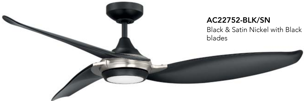
AC22752-BLK/SN Black & Satin Nickel with Black blades