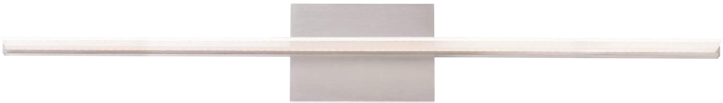
4' / SATIN NICKEL

This ultra-thin, modern bath bar is made possible through the use of edge-lit LED light guide technology. What appears to be a simple plate of frosted glass when off, then illuminates across the entire surface as if the light is coming out of thin air.