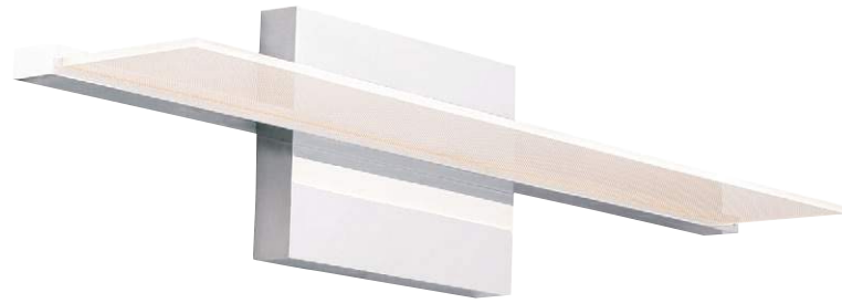
2' / CHROME