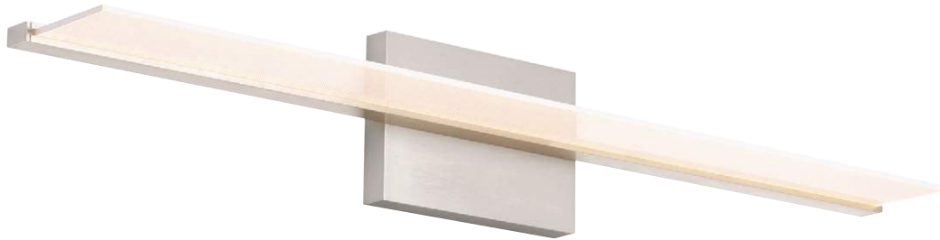
3' / SATIN NICKEL