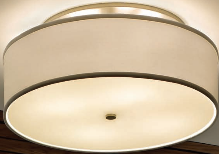
Mulberry Ceiling Large White Satin Nickel / A19 Lamps