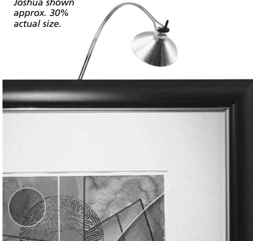
Joshua shown approx. 30% actual size.