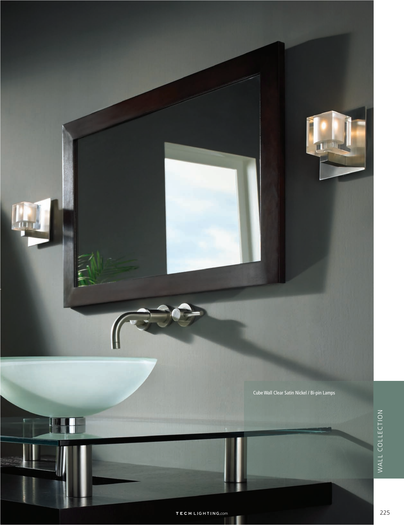
Cube Wall Clear Satin Nickel / Bi-pin Lamps