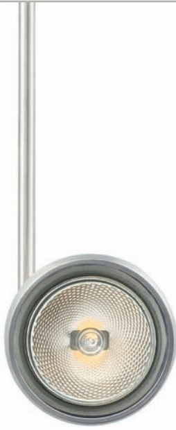
MINI OM WITH SOLID METAL ACCESSORY