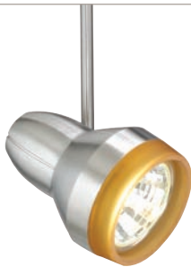
MINI OM WITH AMBER FROST ACCESSORY