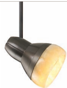
MINI OM WITH ONYX ACCESSORY