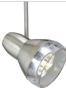
MINI OM WITH CLEAR ACCESSORY