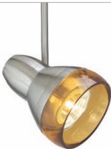
MINI OM WITH AMBER ACCESSORY

Compatible optical controls (sold separately pp. 366-379): Glass Lens or Eggcrate Louver.