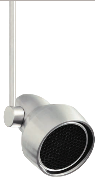
MINI OM WITH SOLID METAL ACCESSORY AND EGGCRATE LOUVER

Flexible, clean head rotates 360°; pivots 260° to direct the beam. Low-voltage, MR16 lamp of up to 50 watts (not included). Accessory required; sold separately.