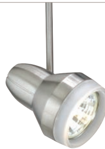
MINI OM WITH FROST ACCESSORY