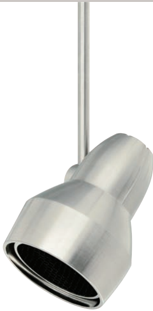
MINI OM WITH SOLID METAL ACCESSORY AND EGGCRATE LOUVER